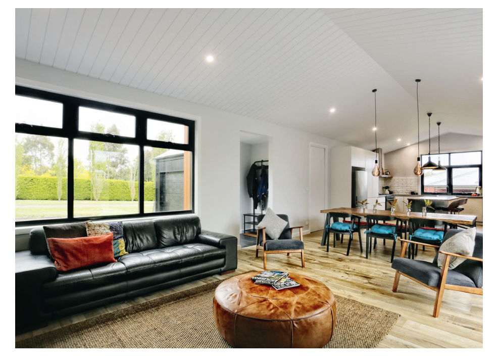
These pages: This home proves pendant lighting isn't just for island bench illumination; a dramatic roofline draws the eye and adds a sense of length to the room; the kitchen is a cocktail of monochromatic magic and nature; subway tiles with a darker grout connect the bathroom and kitchen spaces; high ceilings in the bedroom make the space feel larger; the deck is perfect for entertaining